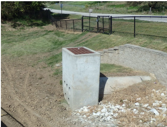
North Pond Discharge Structure

Maintenance of the ponds requires that if the minimum volume is compromised due to excessive sediment buildup, the bottom of the pond must be excavated to regain the required volume.