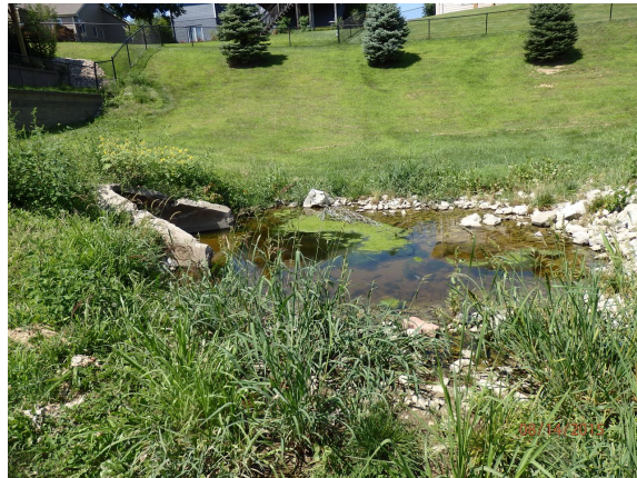
Collapsed Inlet South Pond