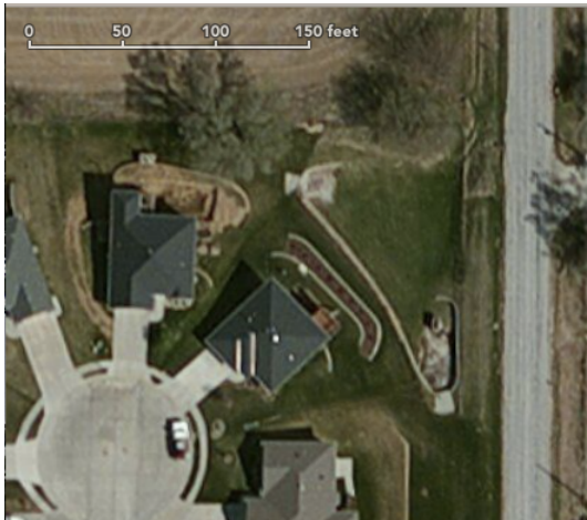
North Detention Pond

There are 2 detention ponds located on the east side of the Briarwood development near State Orchard Road. The North Pond is located on the west side of State Orchard Rd, east of the north end of Aster Circle, south the north Briarwood boundary. The South Pond is located east of Tipton Dr. and South of Briarwood Dr. near the south Briarwood boundary.