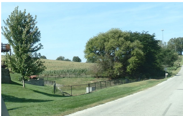
North Pond From State Orchard Road

The detention ponds were designed and constructed as part of the initial Briarwood development to collect storm water runoff and provide a controlled rate of release downstream. When streets, driveways, sidewalks and roofs are added to farmland, the amount of rain absorbed is less and the amount and rate of runoff is increased. Controlled release structures are designed and required to minimize flooding and excessive erosion downstream.