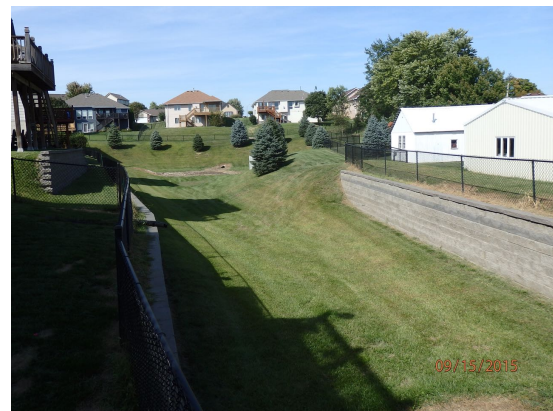
South Detention Pond